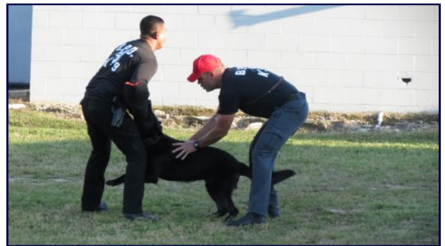
K-9 Demonstrations during the 2018 CPA

Charlie Squad made 12 arrests this month and issued a total of 36 Citations.