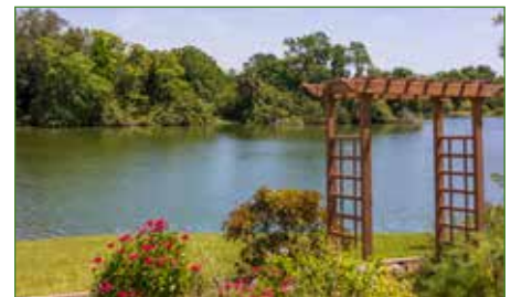
THE LIBRARY'S BACKYARD

Our Public Library is going strong with programs and activities for all ages. The Library has also gone Fine Free, allowing more people to enjoy this facility. Our City Librarian and her staff provide programs to keep the community involved and anxious to return.