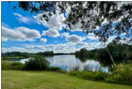
MARY HOLLAND PARK 2015 Shumate Dr. 117.43 acres