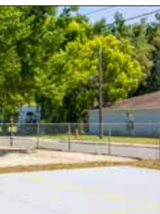
H PARK BASH St. acre