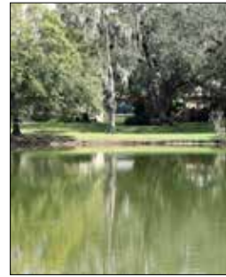
MANN Mann Road & I 2 ac