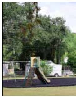
COMMER 1110 W. C 1.34 a