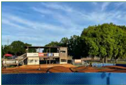
NEW FENCING AT THE RC TRACK

T he Parks, Recreation & Cultural Arts Department is currently engaged in many wonderful programs and improvement projects. We know that having functional and enjoyable parks, facilities and activities improves the quality of life for our city residents and visitors. Please take a moment to read about special projects that are underway in Bartow.