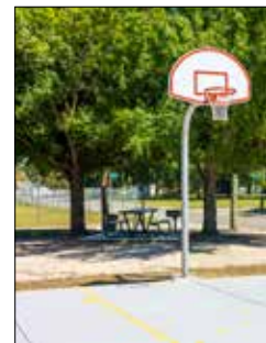
WABASH 990 E. Wa 1 ac