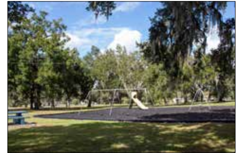
MCLEOD PARK 970 W. McLeod St. 2.61 acres