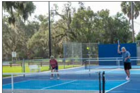
NYE JORDAN PARK 1165 S. Orange Ave. 3.48 acres