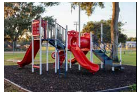
PITTAS PARK 2250 S. Floral Ave. 4.5 acres