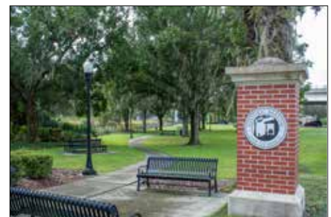
OVER THE BRANCH PARK 715 W. Polk St. .93 acre