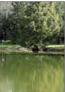
LAKE EL Paso Ave. res