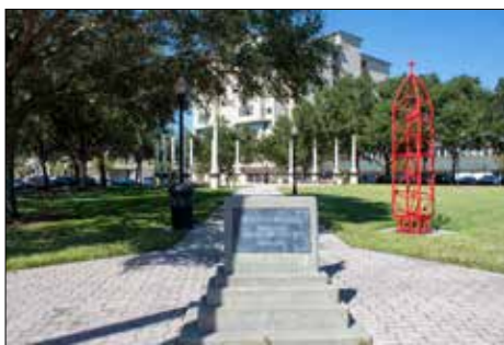
FORT BLOUNT PARK 105 N. Broadway Ave. 1 acre