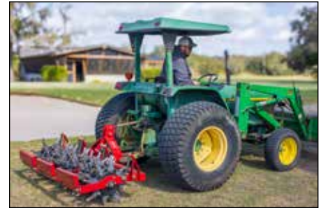
THE NEW AERATOR AT THE GOLF COURSE

Perhaps most exciting is a new Robotic Ball Picker, a completely autonomous golf ball collecting robot that will eliminate this tedious task from our staff's workload.