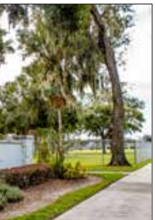
PARK dway Ave. res