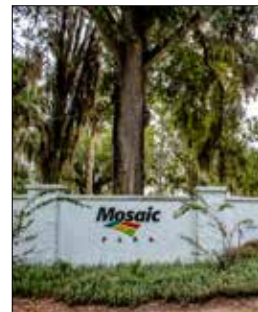
MOSAIC 1865 S. BROOK 8.87 ac