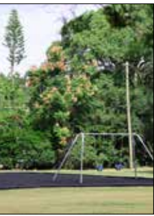
ACE PARK LINTON ST. acres