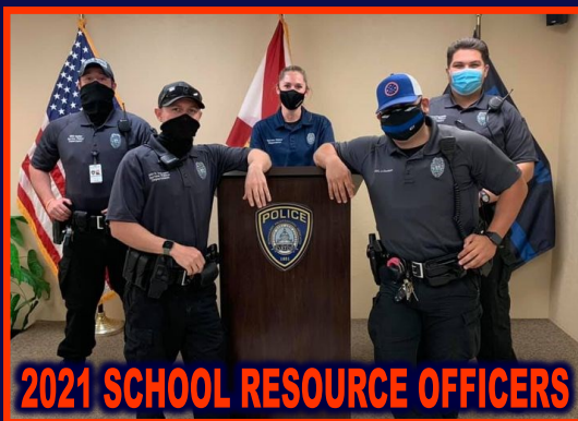
2021 SCHOOL RESOURCE OFFICERS